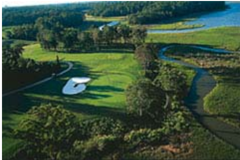
(Riverfront Golf Course)

$5.00 for a mulligan/Raffle (Limit of four per player)